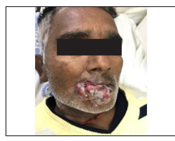
Figure 1: Presented with 4x3 cm swelling over upper lip