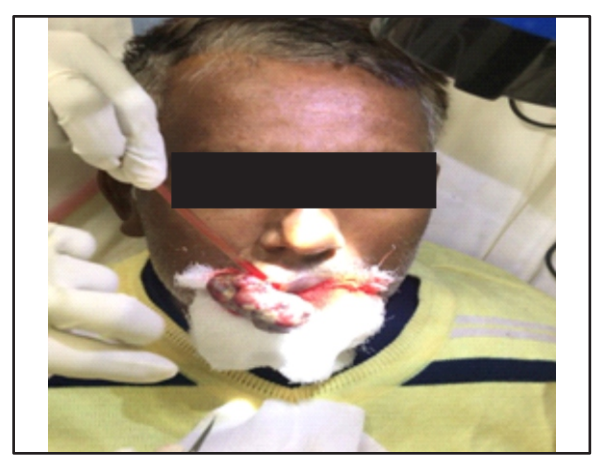
Figure 2: Intra operative picture showing pedunculated lesion

Oral metastasis from RCC are seen in the advanced inoperable stages wherein palliative chemotherapy may be the only treatment option available. Azam et al<sup>11</sup> surgically debrided an RCC metastasis to the tongue and followed it up with radiotherapy for the remaining foci. Kyan and Kato<sup>12</sup> resected a lingual mass, then administered interferon- \alpha and interleukin-II therapy. Yet, mortality may occur